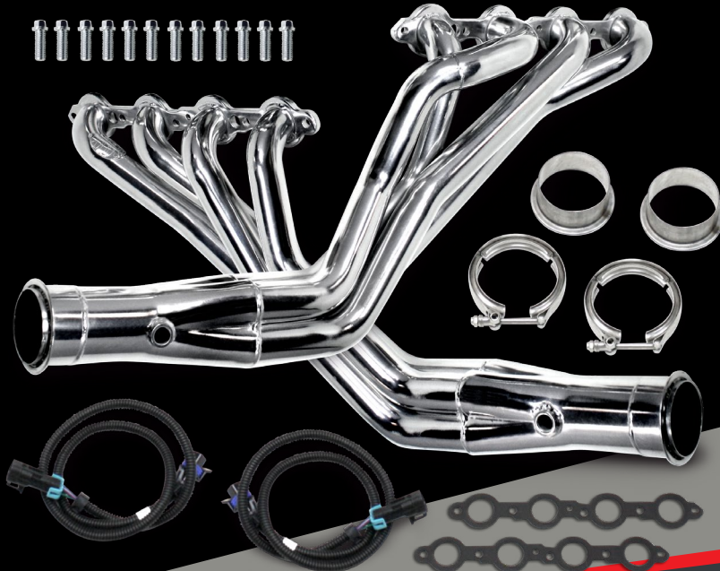
1 3/4" 4-Tube Full Length Header Chevrolet Chevelle LS1-LS6 1964-72 ( Part #D3336 )