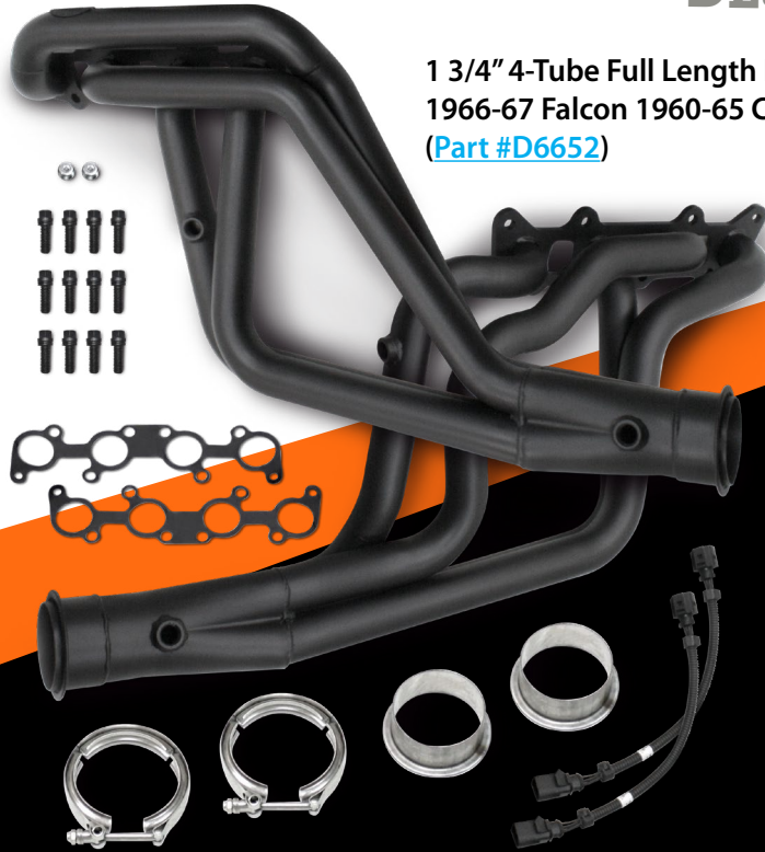
1 3/4" 4-Tube Full Length Header Ford Mustang 1964-73 Fairlane 1966-67 Falcon 1960-65 Cougar 1967-68 Coyote 5.0 Swap. ( Part #D6652 )